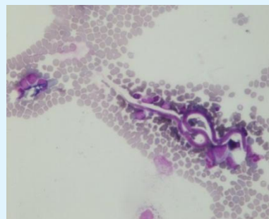
Figure 1: Microfilaria with few blast- 40x

Patient was 50 year female, a follow up case of CML for five years. Patient had no history of fever, lymphadenitis or lymphangitis the only complain was generalised weakness and abdominal swelling due to splenomegaly [1]. General blood picture was examined one month a part. In Peripheral blood examination there was no eosinophilia. In her first report blast were 8% and she was in chronic phase, after one month of that blast were 17% she gone in accelerated phase, now she had 23%blast in peripheral smear and diagnosed as in blast crisis of CML. When these smears were examined a few sheathed microfilariae were seen in the blood smears. They were morphologically characterized as the microfilariae of W. bancrofti , as they lacked terminal nuclei which are the common parasite with uncommon association.