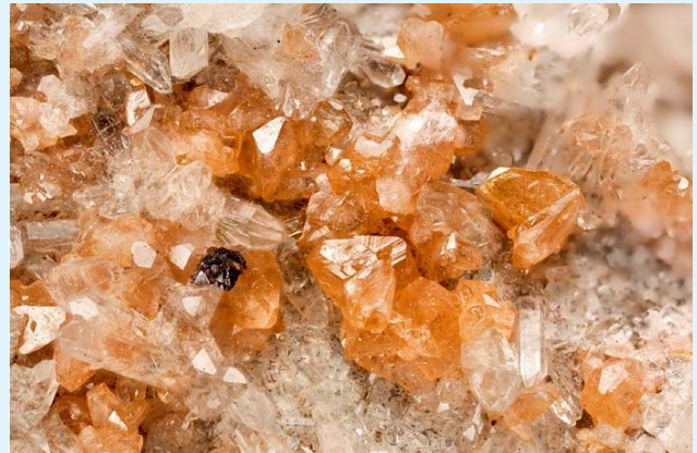
Figure 2: Monazite-(Ce) specimen from Siglo XX mine, Bolivia - the orange mineral is monazite, and the clear one quartz. Geological society of London report 2011.