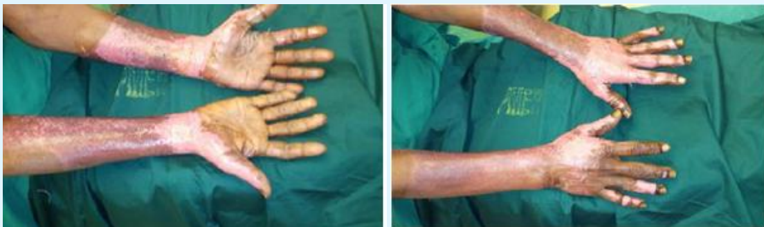
Figure 3: After LLLT 2nd session.