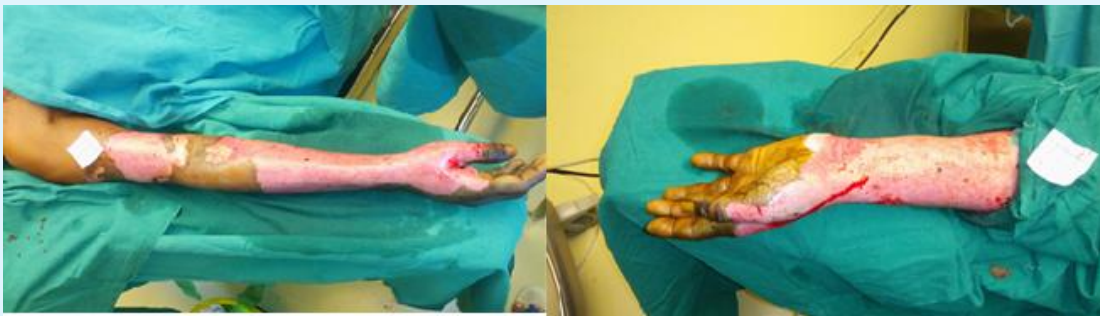
Figure 2: Burn wounds on both upper limbs.