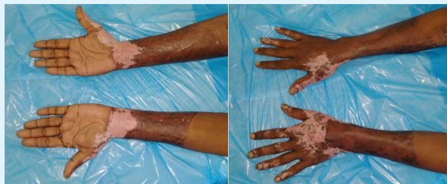
Figure 4: After 6 months of LLLT.