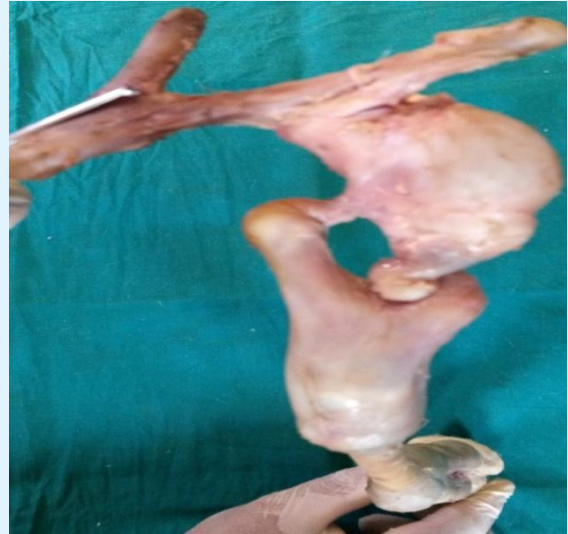
Figure 4: Growth anatomy of the limb: The femur attached tightly to the pelvic bone at the acetabulum. All joints were tightly fixed.

(Figure 5I). The metatarsus and the digit appeared to be normal-like. All joints were rigid (arthrogryposis), (Figures 4 & 5).