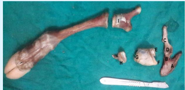
Figure 5: Growth anatomy of the accessory limb: Undeveloped pelvic bone (a wing of the ilium (A), a body of the ilium (B), a body of the ischium (C), with an acetabulum (D). Short femur with a small undeveloped head (E) and trochanter (F) proximally, and enlarged end distally (G). Rudimentary proximal end of the tibia (H). Enlarged calcaneal bone (I). Normal metatarsus and phalanges with tightly fixed joints.