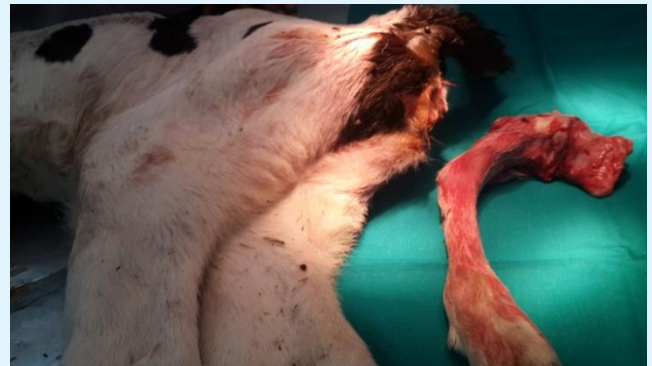
Figure 2: The calf after surgical excision of the accessory limb, the creation of an anal opening, and the closure of the rectovaginal fistula.

For correction of the atresia ani, a circular excision of the skin was made over the anal bulging at the base of the tail. The rectum was explored after dissection of the perineal muscles. The rectum's blind end was grasped to the anal sphincter, and then opened. The rectal mucosa was fixed to the circular skin edge by interrupted sutures, using silk No. one, creating a permanent anal orifice. The rectovaginal fistula was closed transvaginal by purse-string suture along its length [16] (Figure 2).