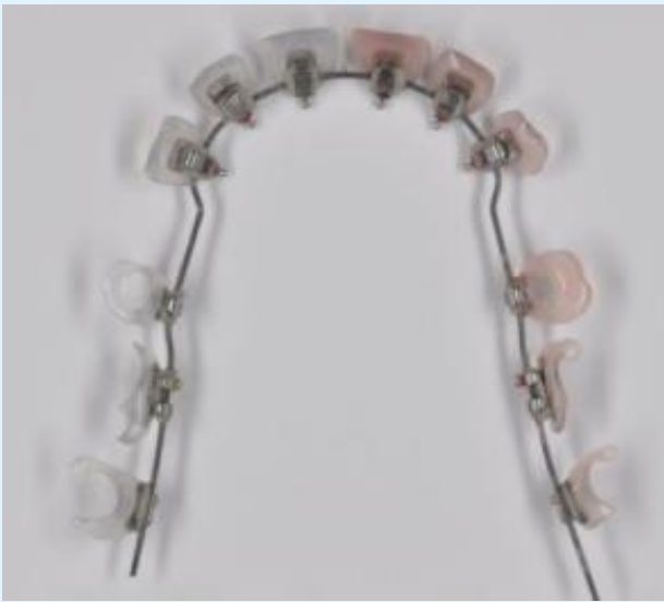
Figure 1: GC Kommonbase customized bracket bases with resin extensions.

Teeth are etched, rinsed and dried and clinical bonding is accomplished with light curable resin-modified glass ionomer cement. The advantage of using RGIC is that the bond strength of an RGIC is not affected in moist condition in situations where brackets are bonded in close proximity to gingival tissue [4-6].