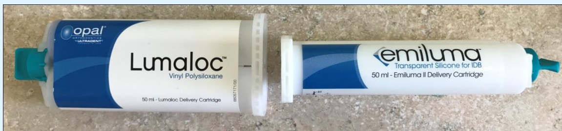
Figure 2: Ultradent's Lumaloc and Emiluma for indirect bonding.

In this system, a combination of silicone and composite