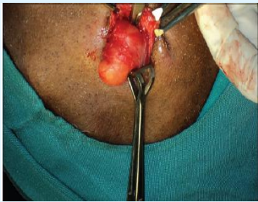
Figure 2: Gross specimen being well encapsulated and separated from surrounding structures (left side of the neck).

The patient underwent standard submandibular gland approach under local anaesthesia with sedation. Excised mass showed a well-circumscribed lesion that was easily separated from the surrounding tissues (Figure 2). Rest of the gland was normal. Marginal mandibular nerve was well preserved.