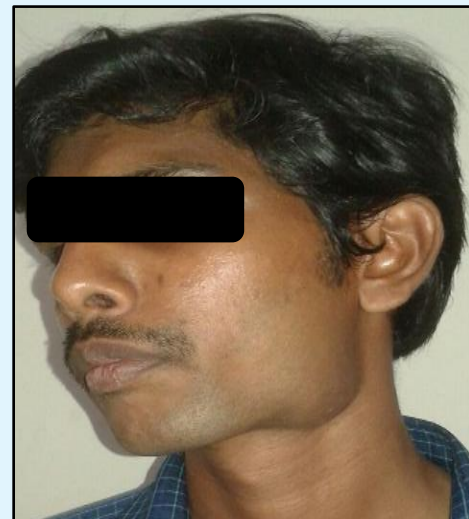
Figure 1: Diffuse swelling in the left side of the neck.

and gradually increased to present size. It was not associated with pain or difficulty in mouth opening. On extra-oral examination, a diffuse swelling seen over left side of neck approximately 3cm × 2 cm in size, with normal overlying skin without inflammatory changes (Figure 1).