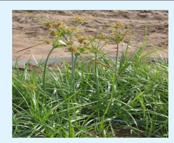
Figure1: Cyperus esculentus L

Peperomia pellucida (L) HBK (Figure 2) belongs to the Family of Piperaceae commonly known as Shiny Bush, Slate pencil plant, pepper elder, rat's ear, shiny bush, silver bush etc. Itis a common fleshy tropical annual, shallow-rooted herb, usually growing to a height of about 15 to 45 cm. It is characterized by fibrous roots, succulent stems, shiny, heart-shaped, fleshy leaves and tiny, dot-like seeds attached to several fruiting spikes. It has a mustardlike odor when crushed.