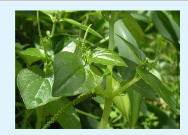
Figure 2: Peperomia pellucida