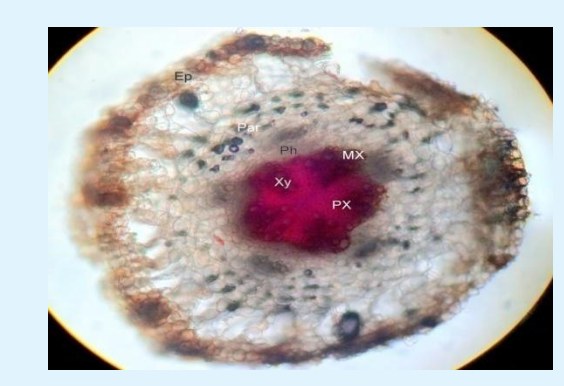
Figure 2: Transverse section of Root of Wedelia trilobata L. Ep: Epidermis; Par: Parenchyma cells; Ph: Phloem; Mx: Meta Xylem; PX: Proto Xylem and Xy: Xylem.