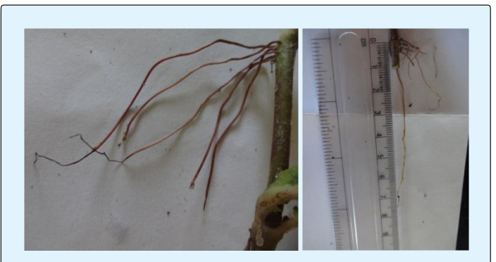
Figure 1: Morphological Characteristics of Wedelia trilobata L. Root.

Organoleptic and microscopic evaluation: The Organoleptic characteristics of root showed in Table 1. The transverse section of root is found to be circular in outline. The epidermis is the outer most layer it is made up of cuboidal shaped cells, which are arranges compactly without any intercellular sapaces. The outer layer consists of many uniseriate multicellular hairs. The hypodermal layer is composed of parenchymatous cells with some intercellular spaces. The endodermis showed the presence of phloem and xylem. The phloem is present in between the medullary rays. The medullary rays are parenchymatous and are biserrate in nature. Phloem is well developed and shows the presence of phloem fibres, which are lignified. It also showed the presence of phloem parenchyma. The xylem region was similar to phloem region and was also surrounded by biserriate. Xylem tissue consists of spiral xylem vessels, xylem fibres and xylem parenchyma as shown in Figure 1 to 6.