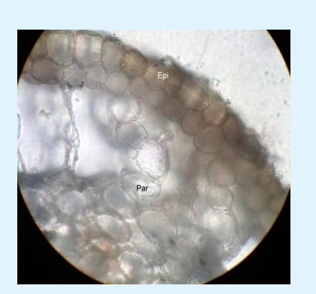
Figure 3: Detailed TS of Root showed epidermis and parenchymatous cells. Epi: Epidermis and Par: Parenchyma Cells.