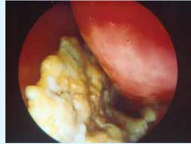
Figure 1: Rhinolith visualized by nasal endoscopy.

The study was conducted at Ministry of Health, Sur Hospital between January 2001 and December 2015 by retrospectively collecting data from the computerized hospital information system. Evaluation of cases were based on demographic profile of the patients like age, sex and side of location of the rhinolith, history of foreign body, coexisting nasal symptoms and illness and previous treatments. The presenting symptom of the patient like nasal block, purulent, malodorous or foetid nasal discharge, nasal or postnasal bleeding and headache were recorded. Rigid diagnostic nasal endoscopy was done for all the patients as a diagnostic tool (Figure 1) computerized axial tomography scan (Figure 2) was done for all the cases to assess the size, site and shape of the rhinoliths. The rhinoliths were removed under general anesthesia in our operating room (Figure 3 & 4). After the surgery patients were advised to perform nasal douching with normal saline. Oral antibiotic therapy, antibiotic nasal ointment (Naseptin) and nasal decongestants were prescribed to all patients. Patients were followed up 3 weeks postoperatively for repeat nasal endoscopy and nasal douching.