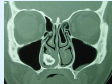
Figure 2: CT scan PNS Showing Rhinolith.