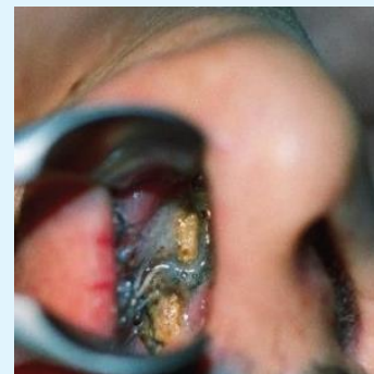
Figure 3: Anterior Rhinoscopy showing rhinolith.