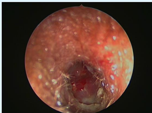
Figure 2: Endoscopic view of the right external auditory canal following removal of a button battery, showing stenosis of the external auditory canal.

An 8 year old boy with known attention deficit hyperactivity disorder (ADHD) presented with an unknown foreign body of metallic appearance in the right ear. It was not possible to remove the foreign body whilst he was awake. Therefore he was taken to theatre on day 2 for removal under general anaesthesia. Intraoperatively a button battery was identified which had eroded the tympanic membrane and could be seen in the middle ear. Removal necessitated a post-auricular approach. Damage caused by the button battery resulted in stenosis of the external auditory canal with mild conductive hearing loss (Figure 2). The perforation healed with no intervention.