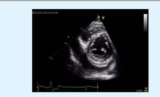
Figure 2: Short Axis View showing pericardial effusion.