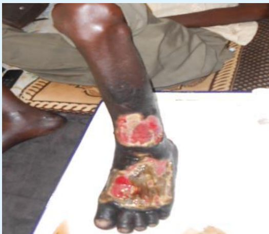
Figure 1: Multiple leg ulcer.

Leg ulcers were unique in 73.2% and multiple in 26.8% (Figure 1). Most leg ulcer lesions had a diameter of between 10 and 19 cm (36.5%), followed by less than 10 cm (24.4%), greater than 30 cm (24.4%), and 20 to 30 cm (14.6%). The signs associated with the ulcer were edema (46.3%), pain (24.4%), absence of pedal pulse (7.3%), ankylosis of the ankle (7.3%) and no sign (14.6%) of the cases. The etiologies were established in 28 out of 41 cases, or 68.29%, of which infectious causes accounted for 28.57%, ulcer by necrotic angioderma (21.42%), arterialulcer (21.42%), venousulcer (17.85%) and pyoderma gangrenosum (10.71%) (Figure 2).