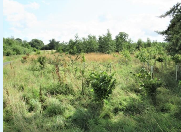
Figure 1: Planted trees about ten years ago.

to emigrate. Today, the soil remains important. Political disruption by Britain, its main trading partner, remains a threat to their livelihood and their own local produce will still be there come what may. The same cannot be said for countries in the Middle East dependent on oil and financial services. If their sales cease, their land is unable to support more than a few camel herders and pearl divers as it used to be before oil was discovered. They have very little soil.