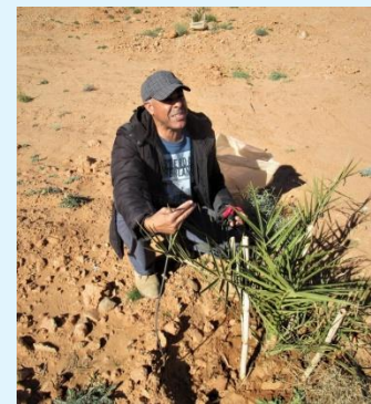
Figure 5: Research on newly planted tree.

In the photo above, beyond the cars are rows of new trees stretching into the distance. In the foreground are pipes carrying water from the irrigation building. Behind the camera is the reservoir.