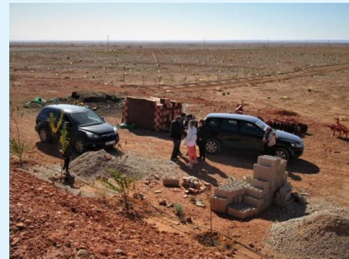
Figure 5: Stretching new tress.

The farmer is constructing a building for the irrigation machinery that includes adding nutrients to the water in carefully calculated doses.