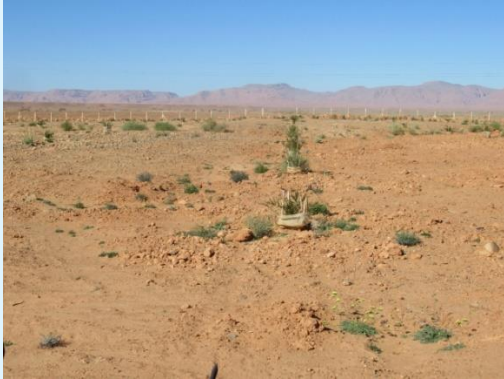
Figure 2: Bared land surface in south of Morocco, north of the Sahara.

The photo above is near Errachidia in the south of Morocco, north of the Sahara. It hardly ever rains here. Without water, soil is not active. A few plants are growing but the land surface is naturally bare. Forwards from the camera runs a row of newly planted madjool date palms [1].