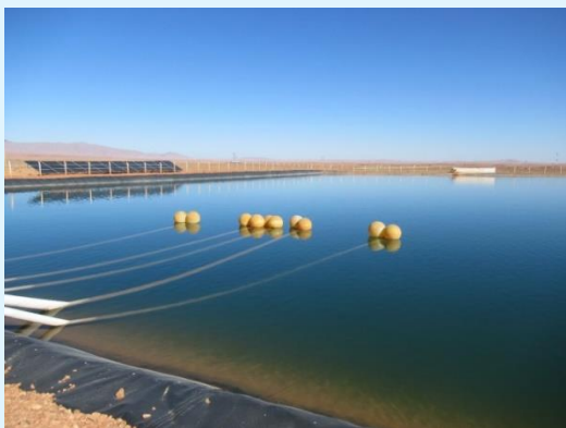
Figure 3: Pumped water from aquifer into reservoir.

Water is pumped from underground (the aquifer) into a reservoir on the date farm shown in the photo below. On the far left are the solar panels powering the pumps. The government of Morocco helps to finance these farms to bring employment to a neglected region and provide exports. There is a vast market for high quality dates.