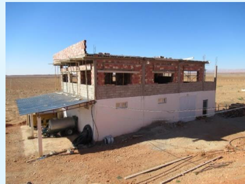
Figure 4: Construction building for irrigation machinery.

The farmer is constructing a building for the irrigation machinery that includes adding nutrients to the water in carefully calculated doses.