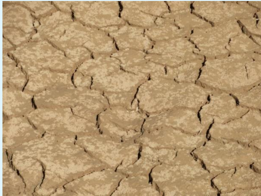
Figure 6: Ground Cracks.

Here the farmer is kneeling beside a newly planted tree. In his right hand is an irrigation pipe with a tapered end that is inserted into the soil close to the roots of the tree. Notice that the pipe is thinner than an electrical cable. Every tree on this vast farm is fed by a permanently fitted irrigation pipe the same as shown here. Water is the scarce resource that is carefully managed to deliver enough nutrients to the tree without any wastage. The process is called drip feeding. By the third year, harvesting dates will start.