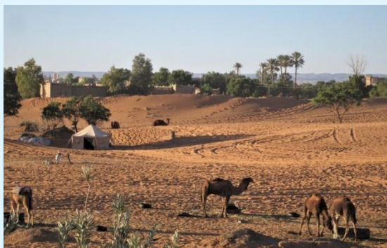
Figure 7: Oasis of Merzouga.

Where there has been surface water that has evaporated the ground cracks. Should any plants have started to grow here, their roots are torn by the cracks opening up and releasing moisture from below. Soil and plants need a constant supply of water.