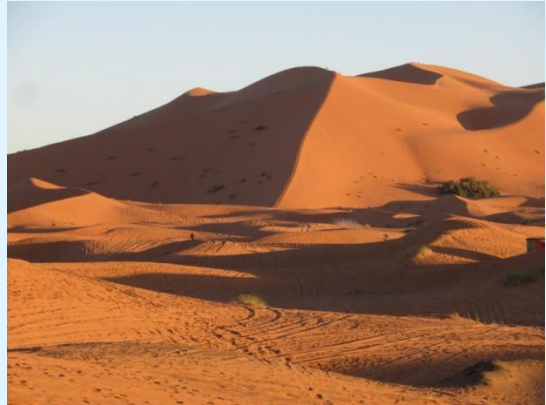
Figure 8: No plant area in Africa.

The photo below is 180 degrees to photo above with the dunes of the Sahara stretching south into Africa. No water means no soil means no plants mean no life.