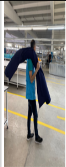
P20: Roll Fabric Transportation Process