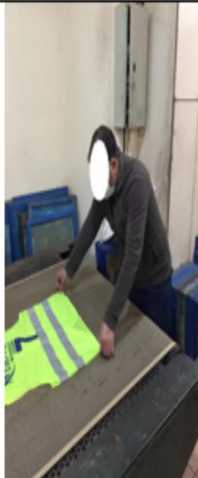
P18: Drying Process