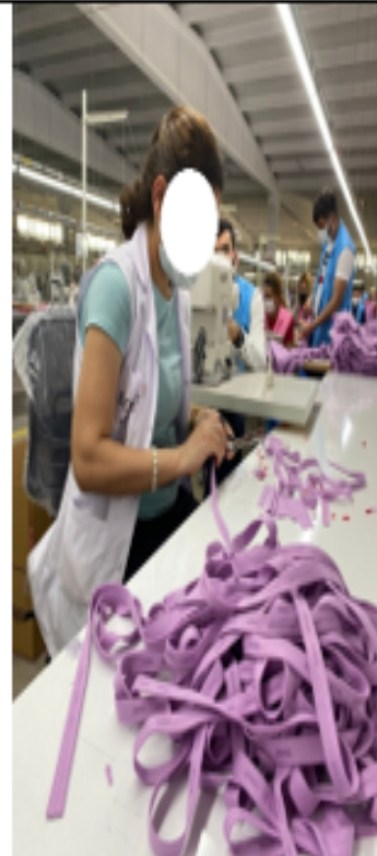
P21: Zipper Installation Process