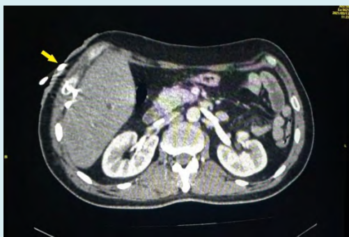
Figure 2: External bile drain.

The evolution was marked by a decrease in the intensity of the jaundice and pruritus. The stools regained their normal color and the urine was still dark. The drain was functional bringing back 2 to 2.5 liters of bile per day. The patient had no other fluid losses, notably no vomiting or diarrhea. A biological assessment performed three days after the installation of the bile duct showed a regression of the biological cholestasis, with the appearance of a hyponatremia at 124 mmol/L which is hypo-osmolar (254 mOsmol/Kg) as