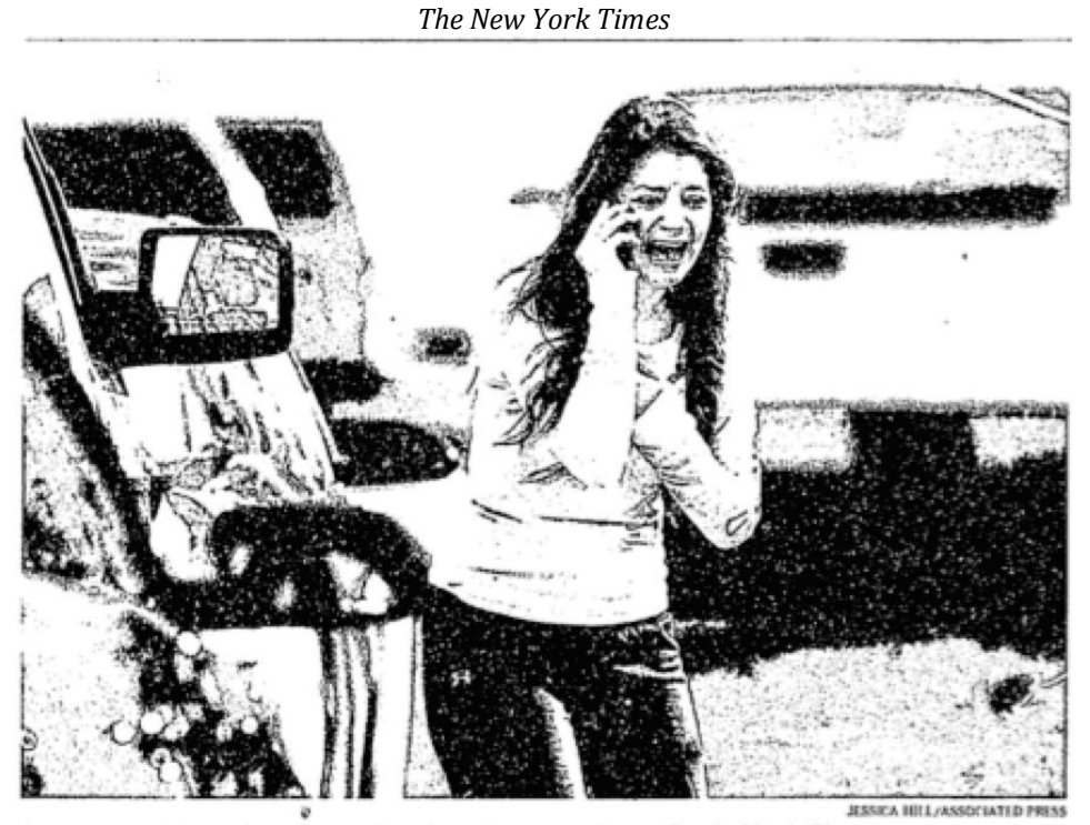
A woman waiting to hear news about her sister, a teacher at Sandy Hook Elementary.

Appendix I: Photos – Conflict and Gatekeeping Theory (continued) Sandy Hook Shooting: