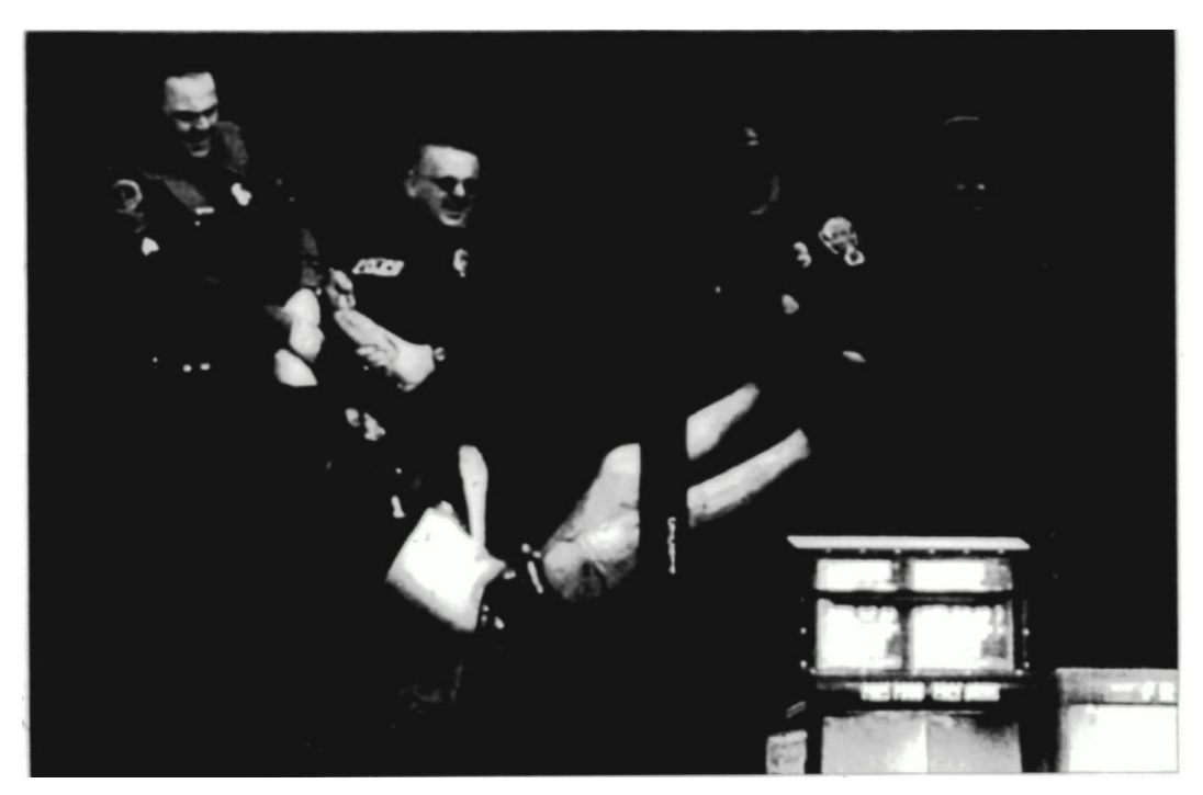
The Richmond Times