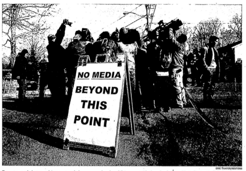
Reporters and photographers surrounded a woman who placed flowers outside the school where 20 students were killed.