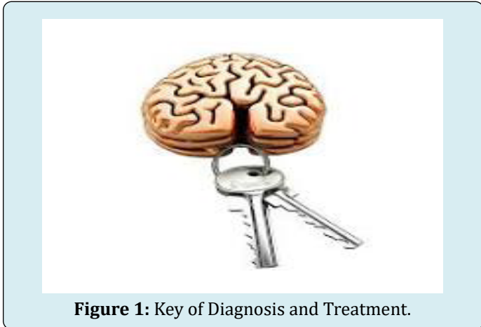
Figure 1: Key of Diagnosis and Treatment.

No MRI was performed on the brain. No periodic medical examinations were performed to detect any illness resulting from the side effects. Many patients complained from side effects without responding from doctors.