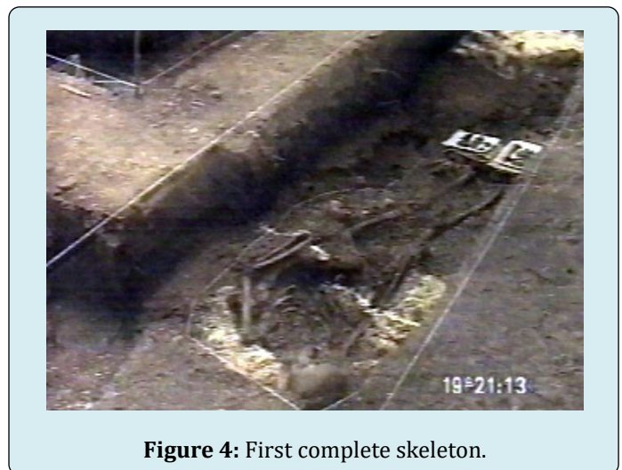
Figure 4: First complete skeleton.