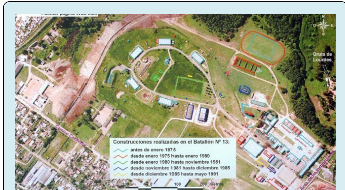
Figure 2: Constructions carried out in the N battalion.