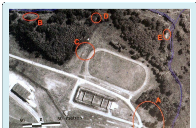
Figure 3: Constructions carried out in the N battalion.