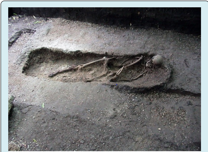
Figure 5: Set of human skeletal remains.

methods and confirmed by DNA analysis to be those of Fernando Miranda [17,18].