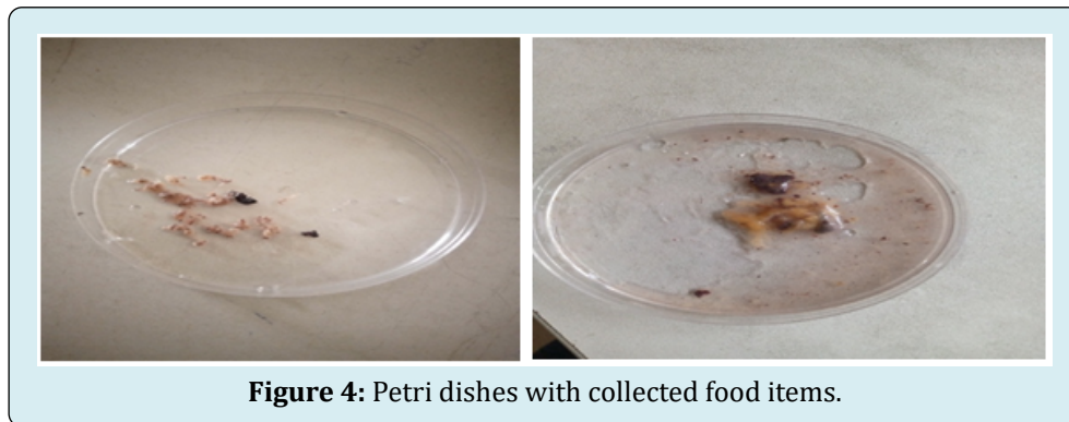
Figure 4: Petri dishes with collected food items.