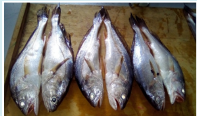
Figure 2: Samples of Pseudolithus elongatus .

Monthly samples Figure 2 of the Bobo croaker, Pseudolithus elongatus were caught between November, 2020 through April, 2021 in Jaja creek, and a total of 180 fishes were collected in all. Services of local fishers were employed in the collections of the fish. The fish specimens were washed with salt water to remove any foreign debris such as leaf, mud, sand, that must have been attached to the body of the fish. They were preserved immediately after capture in 10% formalin solution in a plastic container prior to laboratory procedures. Thereafter, the samples were transported to Zoology laboratory, Akwa Ibom State University and preserved for further analyses.