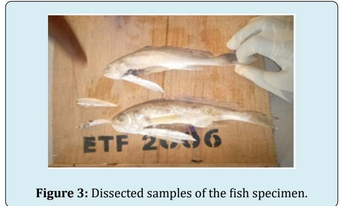
Figure 3: Dissected samples of the fish specimen.

In the laboratory, the total length (TL) of each fish was measured using a measuring board and recorded to the nearest centimeter and weighed to the nearest 0.1g total weight (TW), using a top loading weighing balance. Each fish was dissected and the gut removed and preserved in 4% formalin solution. The gut of each fish was slit open using a scissors and the gut contents were poured into a petri dish, smeared with a few drops of water and the food items were identified macroscopically, then microscopically to the nearest taxonomic possible. Analysis was carried out using frequency of occurrence and numerical methods respectively (Figures 3 & 4).