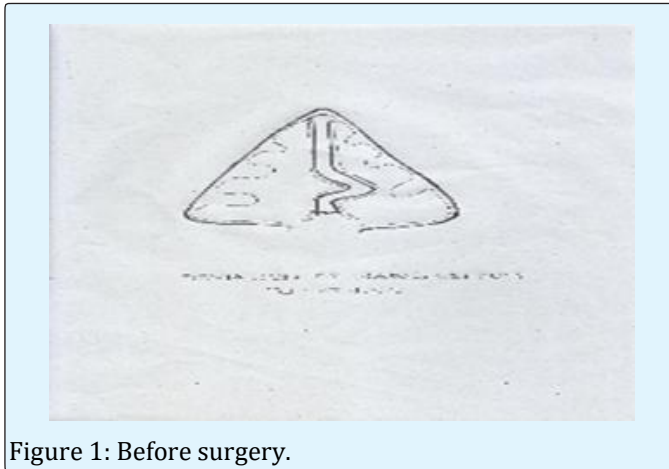
Figure 1: Before surgery.

zag manner, ensuring that all the areas of separated mucous membranes are closed together. Postoperatively, head end of the patient is kept elevated, and saline nasal irrigation, topical nasal decongestant nasal drops are put, antibiotics, antihistamines and analgesics are given. If found necessary, a 5 to 10 minutes packing can be given before the patient comes out of the Anesthesia and then the pack is pulled out. A smooth recovery from the Anesthesia is very much essential otherwise bleeding can occur. If mild oozing is noticed at this time, Inj. Tranexamic acid can be given and usually the bleeding stopped.