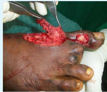
Figure 8: Raising of the flap.