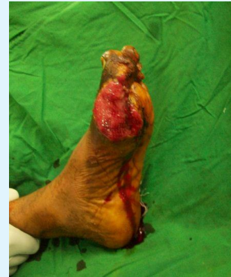
Figure 2: Figure showing defect in distal left foot and great toe of case 1.

to provide the coverage of the defect. A split thickness graft from the opposite thigh was used to cover the donor site raw area. The post-operative period was uneventful and the flap was healed well without any complication (Figures 1-5).