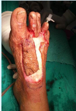
Figure 11: Contracture was released & flap was raised.