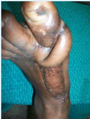
Figure 5: Follow up picture after 3 months.