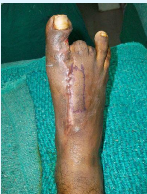
Figure 7: Flap Marking.

A 48 years old male patient who was a known diabetic presented with a chronic ulcer for 2 months following a trauma over the radial border of the great toe of right foot with a exposed proximal phalynx. Patient had post traumatic amputation of 2 nd and 3 rd toes. There again, a distally based first web space flap based upon a perforator arising from DCA was raised as an islanded flap to cover the defect. Again the flap was healed without any necrosis or infection (Figures 7-9).