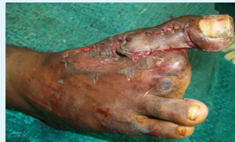
Figure 9: Final inset of flap with skin graft over donor site.

Another case was of a 16 years old girl who presented with post burn scar with contractures of 2 nd , 3 rd and 4 th toes of right foot with hyperextension of metatarsophalangeal joints of those toes following a burn injury sustained 4 years ago. She was operated with the release of the contractures with K wire fixation of the toes and a distally based first web space flap based upon a perforator arising from DCA was raised to cover the raw area over forefoot resulting after the release of the contracture. Flap was survived well with no significant complication (Figures 10-12).