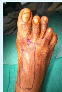
Figure 10: Figure showing post burn contracture of distal forefoot with contracture over toes in case 3 with flap marking.

Another case was of a 16 years old girl who presented with post burn scar with contractures of 2 nd , 3 rd and 4 th toes of right foot with hyperextension of metatarsophalangeal joints of those toes following a burn injury sustained 4 years ago. She was operated with the release of the contractures with K wire fixation of the toes and a distally based first web space flap based upon a perforator arising from DCA was raised to cover the raw area over forefoot resulting after the release of the contracture. Flap was survived well with no significant complication (Figures 10-12).