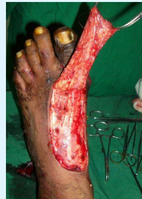
Figure 3: Raising of the flap.