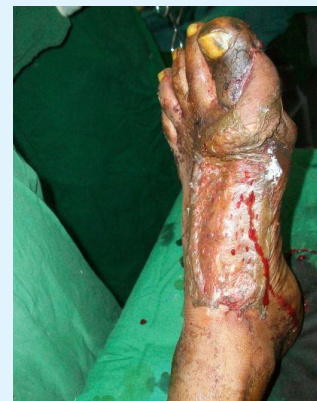
Figure 4: Final inset of flap with skin graft over donor site.