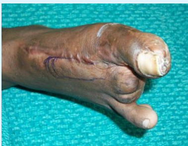
Figure 6: Figure showing defect right great toe of case 2.

A 48 years old male patient who was a known diabetic presented with a chronic ulcer for 2 months following a trauma over the radial border of the great toe of right foot with a exposed proximal phalynx. Patient had post traumatic amputation of 2 nd and 3 rd toes. There again, a distally based first web space flap based upon a perforator arising from DCA was raised as an islanded flap to cover the defect. Again the flap was healed without any necrosis or infection (Figures 7-9).