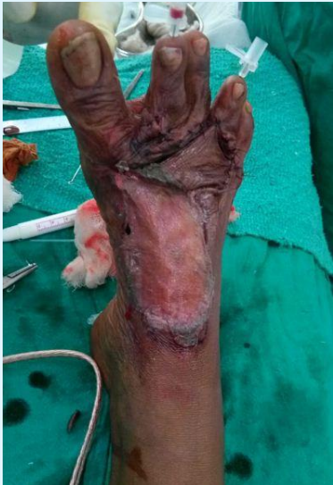
Figure 12: Final inset of flap with K wiring of the toes.