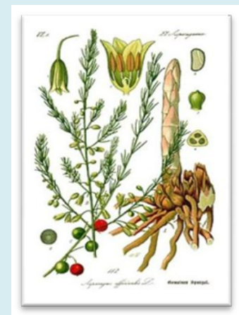
Figure 13: Asparagus Racemosus .

This herb has been used for its multiple health benefits over centuries. Its medicinal properties have already been reported for nervous and gastric disorders. For centuries ayurvedic physicians have used its beneficial effects for recovering female health and the female sexual system. Its main sphere of action is on the female sexual system where it helps to increase the libido thereby helping improve confidence and self-esteem (Figure 13).