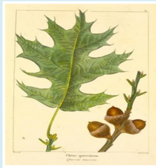
Figure 2: Quercus Tinctoria [35].

Quercetin is a polyphenolic compound that is found in plants, like apples or tea. It has the potential to stop or hinder the growth of the tumor cells [32]. Quercetin is a biologically active compound and has remarkable anti-inflammatory, antioxidant, and anti-tumor activities [33]. Quercetin inhibits proliferation and increases the sensitivity of ovarian cancer cells to cisplatin and paclitaxel [34] (Figure 2).