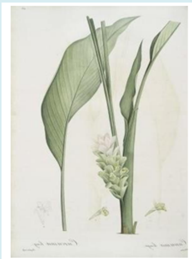
Figure 3: Curcuma longa [35].