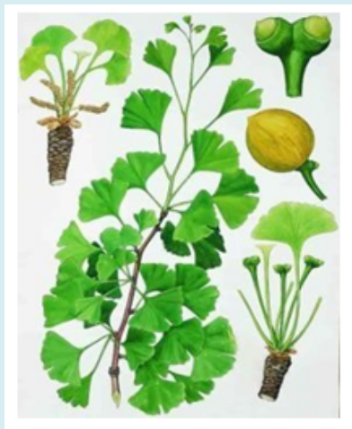
Figure 14: Ginkgo Biloba .

It has been shown to affect gene expression. Anticancer (chemopreventive properties are related to its antioxidant, anti-angiogenic, and gene-regulatory actions. In humans, Ginkgo biloba extract inhibits the formation of radiation-Induced clastogenic factors and ultraviolet light-induced oxidative stress [60] (Figure 14).