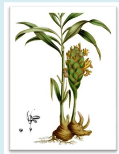
Figure 5: Zingiber Officinale [40].

solution containing ovarian cancer cultures, the mutant cells die. Ginger destroys ovarian cancer cells in two ways. The first way is apoptosis (a process of cellular self-destruction) then by autophagy where the cells digest themselves [38,39] (Figure 5).