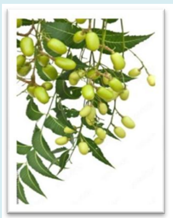
Figure 7: Azadirachta Indica .

The neem tree is another Indian species that has long been used in traditional medicine, although as a treatment for malaria. Recent research has established that one of some active compounds in neem, gedunin, may slow or even halt the spread of certain cancers. When human ovarian cancer cell lines are treated with gedunin in-vitro, the reisan80% reduction in cell proliferation, as well as enhancement of the anti-proliferation effect of cisplatin, a drug that is already widely used to treat ovarian cancer (Figure 7).