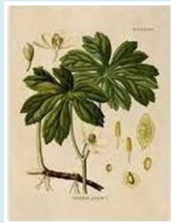
Figure 12: Podophyllum Peltatum .

May apple plant resembles a fan-like structure with wide leaves that are edible and medicinal. The Etoposide compound form helps in killing the cancerous cells through the process of enzyme-mediated DNA scission thereby blocking the action of cells on the cancer cell DNA resulting in the prevention and killing of cancerous cells. Some side effects of Etoposide are loss of appetite, back pain, skin discoloration, hair loss, diarrhea, and increased sweating (Figure 12).