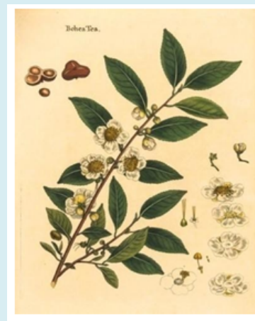
Figure 6: Camellia Sinensis [42].

Green tea is an aqueous infusion of dried unfermented leaves of Camellia sinensis (Family Theaceae) from which numerous biological activities have been reported including antimutagenic, antibacterial, hypocholesterolemic, antioxidant, antitumor, and cancer-preventive activities (Figure 6). The high levels of antioxidants found in green tea are responsible for the anticancer activity. Green tea reduces the risk of an ovarian cancer. Ovarian cancer has dropped by 75 percent in the case of those women who consumed the beverage consistently for over 30 years [41].