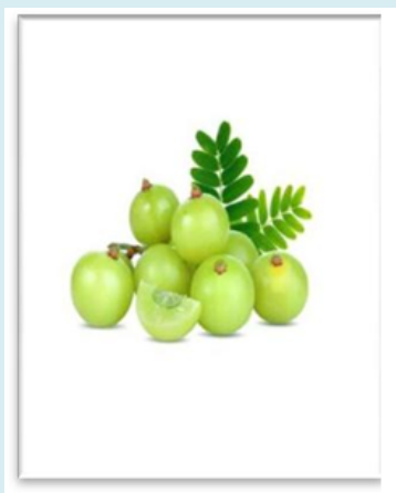
Figure 12: Embilica officinalis .

Embilica officinalis , also called Indian Gooseberry. It is sour, bitter, and a bit astringent the drug possesses cardioprotective, antipyretic, analgesic, antianaemia, wound healing, antidiarrheal, nephroprotective, and neuroprotective properties along with radio-modulatory, chemo-modulatory, chemopreventive, antioxidant, anti-inflammatory effects, which are also highly essential in the treatment of cancer (Figure 12).