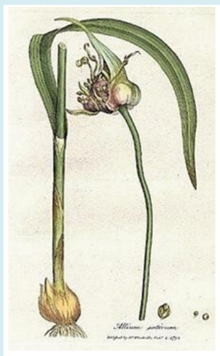
Figure 4: Allium Sativum .

Garlic is a remarkable plant, that contains multiple beneficial effects such as antithrombotic, antimicrobial, hypolipidemic, antiarthritic, hypoglycemic, and antitumor activity. It has approximately 33 sulfur containing compounds. Garlic has an anticancer effect. Garlic inhibits tumor cell growth and chemopreventive effects. Hence, the consumption of garlic may provide some kind of protection from cancer development [37] (Figure 4).