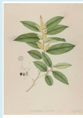
Figure 10: Symplocos Racemosa .

Lodhra has a big tree bark that acts as an astringent and is commonly used in leucorrhoea which is the excessive discharge from the vagina. It is beneficial in case of excessive menstruation, painful menstruation, and delayed menstruation. In many types of cancer, especially cancer of the female reproductive system this herb wor (Figure 10).