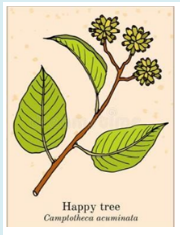
Figure 11: Camptotheca Acuminata .

The Camptotheca known as the Happy Tree, is a fern-like deciduous tree with a variety of medicinal uses. CPT-11 is a compound that is extracted from the Camptotheca acuminata plant and is administered in patients with brain tumors through the drug Irinotecan. It is used to prevent the mutation of cells into cancerous cells with the possibility of preventing or reducing the disease into one that is benign (Figure 11).