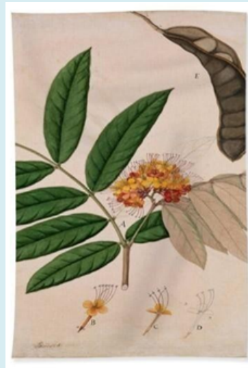
Figure 9: Saraca Indica .

Ashoka bark is very beneficial in treating menstrual disturbances and can regulate the female m menstrual cycle. It is used in the treatment of various kinds of tumors of the female reproductive system. The pre-menstrual tension can be cured using Ashoka (Figure 9).