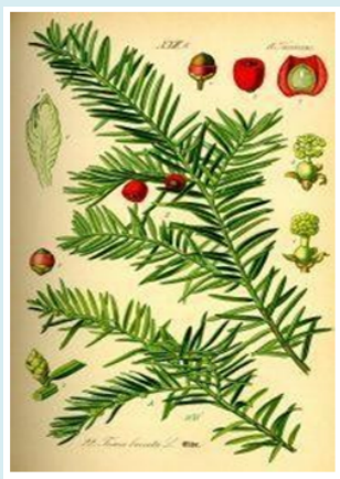
Figure 8: Taxus Brevifolia .

The Pacific Yew, otherwise known as the Western Yew, is a tree with many special uses. Its bark restrains the desired properties to treat cancer effectively. The existence of this coniferous tree can be seen in Southeast Alaska and also in the Western part of the United States. A plant of many uses; its medicinal uses are integral in cancer treatment, especially refractory ovarian cancer (Figure 8).