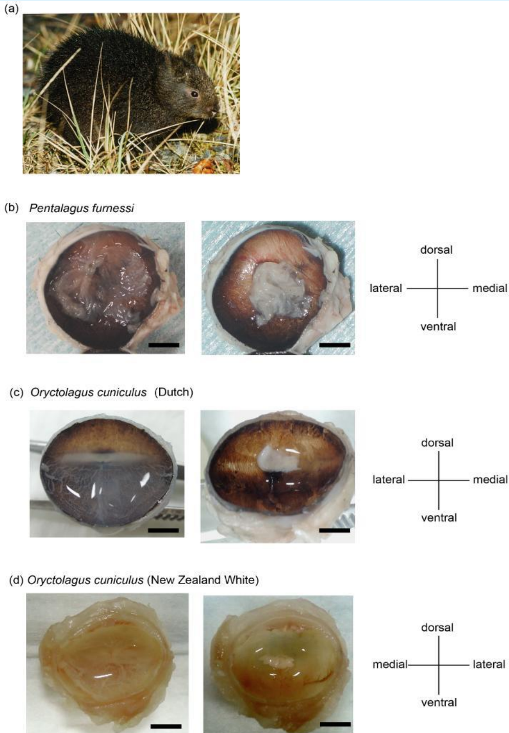
Figure 1a: Original photograph of a live Amami rabbit. Note that they have small ears and eyes. b-d: Anterior portion of the coronally sectioned eye of b. Amami rabbit, c: Dutch rabbit, and d: New Zealand White rabbit. Photographs with or without retina are shown separately. Scale Bar, 5mm.