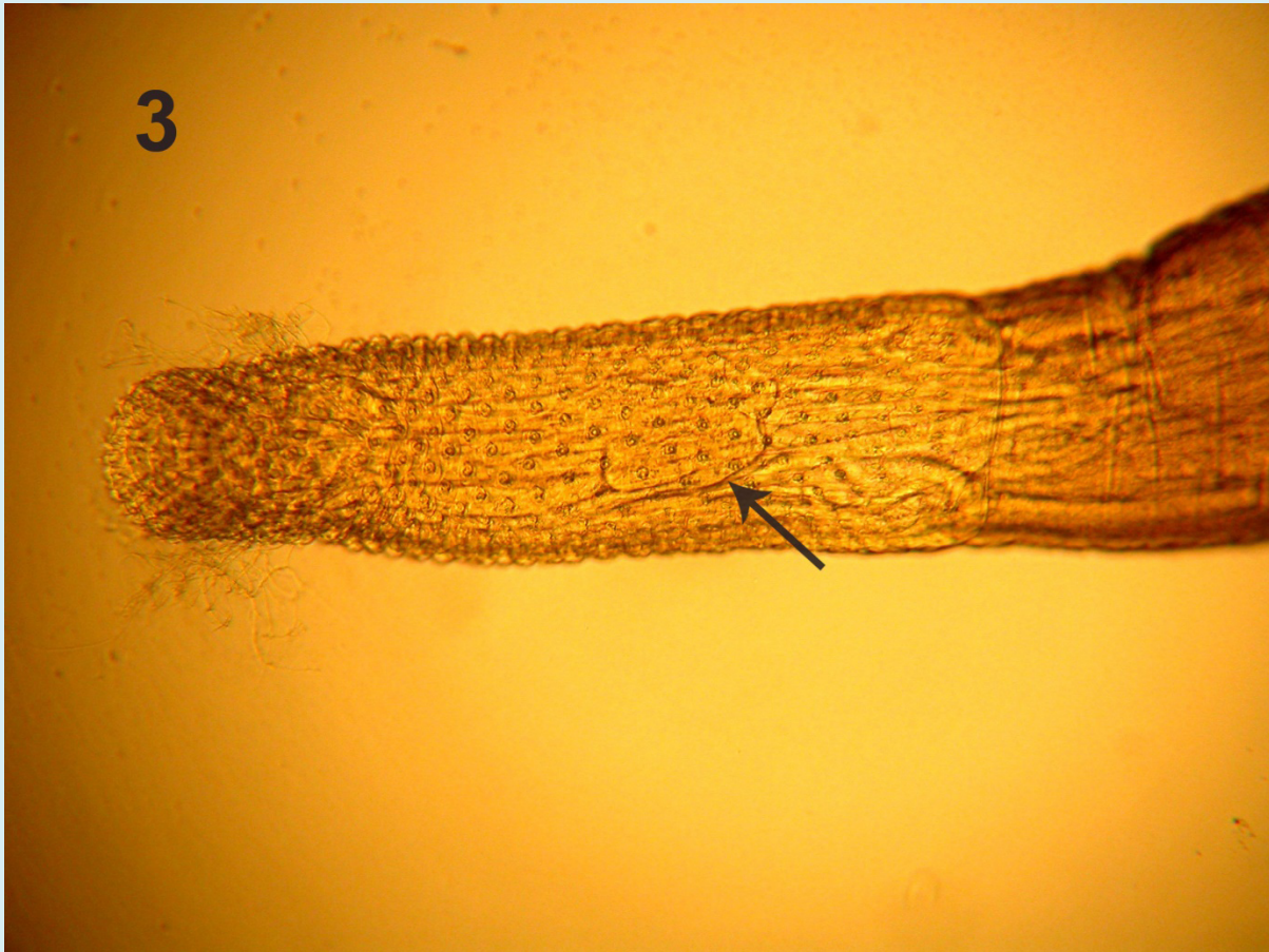
Figure 3: Microscope image of the whole proboscis of the male specimen shown in Figure 2. Length of whole proboscis is 1.37 mm. See the outline of the receptacle (arrow).

retracted. The type of proboscis characteristic of these worms apparently only retracts but is not equipped to invaginate (Figure 1). Upon retraction, the receptacle appeared to get displaced more posteriorly extending well beyond the posterior end of the proboscis. The insertion and detail of the anteriorly nucleated lemnisci are newly documented. Compare the line drawing (Fig. 1) with the line drawing of the anterior part of a female specimen with totally everted proboscis in Amin, et al. [2].