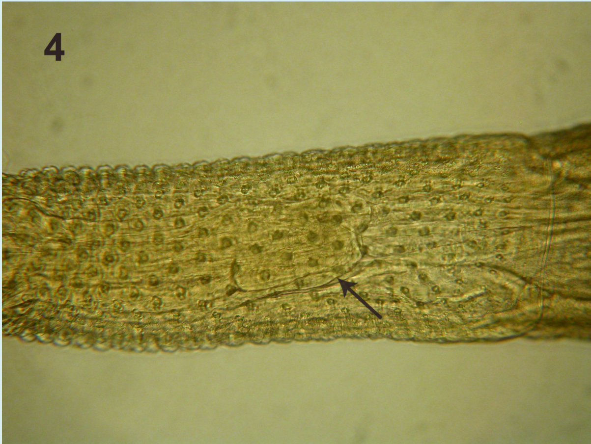
Figure 4: Posterior part of the same proboscis in Figure 3 measuring 1.00 mm in length. See the distribution of the small hooks. The outline of the receptacle is marked with an arrow.

I. sanghae . The generic diagnosis is herein emended to reflect this additional information of the male anatomy (Fig. 2).