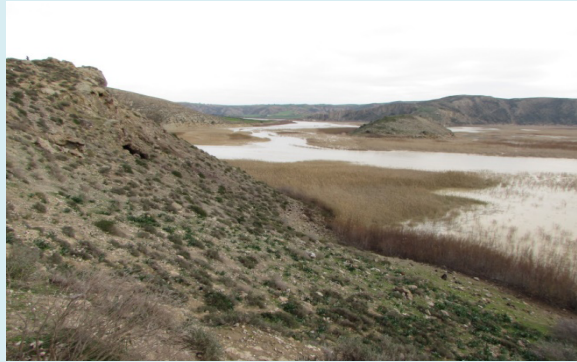
Figure 3: Typical habitat of C. convexus in rocky areas.