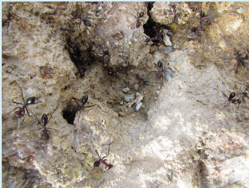
Figure 4: Anthill of C. convexus .