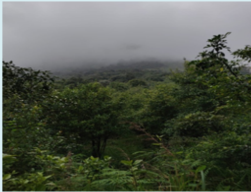
Figure 6: Keeriparai Forest Range.

The habitat of Neurobasis chinensis is found between 500 - 1200 m altitudes. It perches on emergent boulders and fallen logs in streams. The bright green dorsal iridescence of the hind wings of Neurobasis chinensis males, very rare in Odonata, is known to play a significant role in their courtship behavior [5]. Female laid eggs on submerged decaying logs in streams during south west monsoon. The flight season is from May to November (Figure 6).