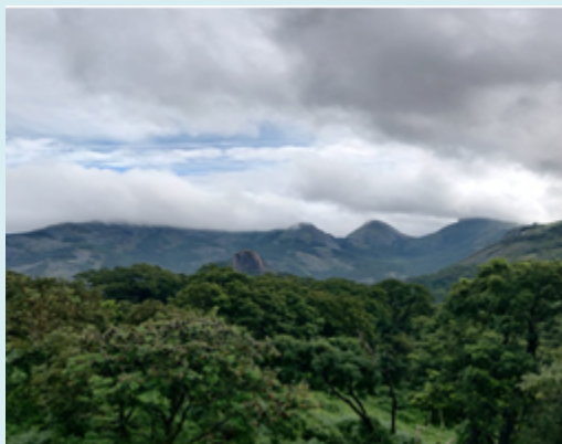
Figure 3: Tropical Evergreen Forests.

In the invertebrate world of Odonates, Neurobasis chinesis is always considered an ecological indicator to study the eco system. The male will have abdomen of size 45-50