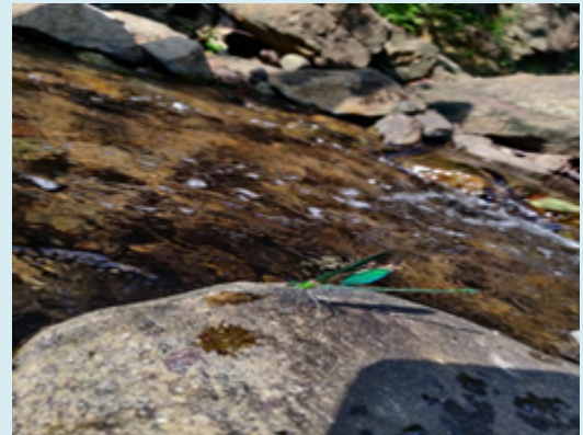
Figure 4: Male Neurobasis chinesis .

mm, hind wings of 32-38 mm with eyes blackish brown above and bluish white below [4]. The legs are dark bronze with white outer stripe, rounded wings at tips with forewings transparent, tinted with pale yellowish green with emerald green venation. The hind wings are opaque, two thirds iridescent green or peacock blue. Apical half is blackish brown with violet reflections and green iridescent veins. Underside of hind wings will be uniformly blackish brown with dull golden reflections. The abdomen will be iridescent green above and on side and underside will be black. The 9th and 10th segments are whitish in the abdomen (Figure 4).