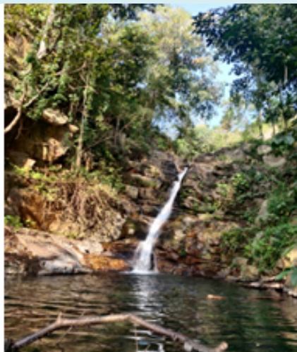
Figure 7: Habitat of Neurobasis chinensis.

The study was conducted in the Keeriparai Forest Range 29 km 2 , a part of Agasthiyamalai 8.23 Latitude and 77.50 Longitude located in the southern end of Western Ghats. Geologically, the rocks are granitoid gneiss and the terrain is undulating [6].