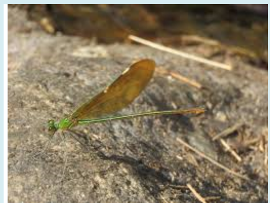
Figure 5: Female Neurobasis chinesis .

The female will have will have abdomen of length 44- 50mm, hind wings of length 36-40 mm. Eyes will be brownish above and yellowish below [4]. The thorax and legs are similar to that of males. The wings are transparent and amber colored. All wings have a round creamy white central opaque spot on the edge of the wing. Wing spot is absent in forewings and creamy white in hind wings. The abdomen is dull iridescent green above and black below. Green metallic stripe on sides in all segments Bordered with black (Figure 5).