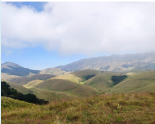
Figure 2: Mountain Roof Top Forests (MRTFs) in Western Ghats.

The geological formations are mostly of Archaean age represented by gneisses and granites. Rivers and stream beds consist of alluvial sandy soil. This forest receives 3000 mm rainfall spreading over a period of 7-8 months. Forest has varied range of habitats, from low elevation rubber and clove cultivations, dry teak forest to shrub and Deciduous forests to Tropical evergreen forests and high elevation grasslands called the Mountain Roof Top Forests (MRTFs) (Figure 2). Fresh waters streams, canals and pools are found along the course of the Keeriparai Forest Range. As rubber cultivation is predominant in this area, the monoculture exhausted the soil and needed a lot of pesticides and fertilizers. This would have caused soil and water pollution that gives negative consequences to the natural environment [3]. In this eco system, because of their size and interesting behavior, dragonflies and damselflies are considered to be the most charismatic of all aquatic insects (Figure 3).