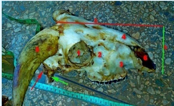
Plate 2: Lateral view of the skull of Yankasa Ram showing: 1.Orbit ; 2. Lacrimal bone; 3. Maxilla; 4. Nasal bone; 5. Cornual process; 6. Incisive bone; A. Length of skull; B. Height of skull; Green arrow. Jugular process; Red arrow. Occipital condyle.