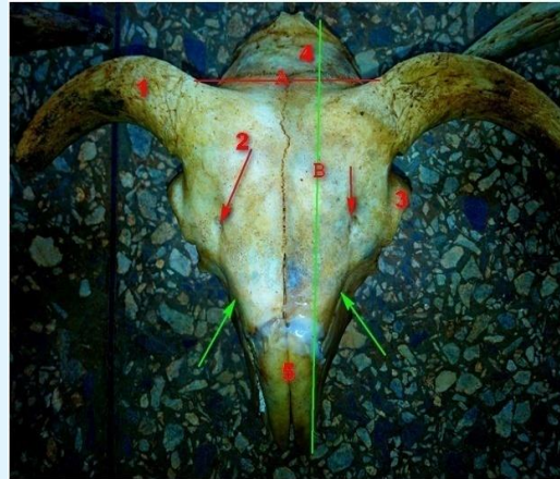
Plate 1: Dorsal view of the skull of Yankasa Ram showing: 1. Cornual process; 2. Frontal bone; 3. Orbit; 4. Inter parietal bone 5. Nasal bone; A. Width of the skull; B. Length of the skull; Red arrow. Supraorbital foramen; Green arrow. Infraorbital foramen.