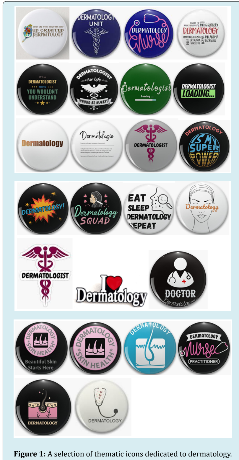
Figure 1: A selection of thematic icons dedicated to dermatology.

a medical discipline as dermatology and the profession of a dermatologist. So, in Figure 1, this collection of icons is presented [1-10].