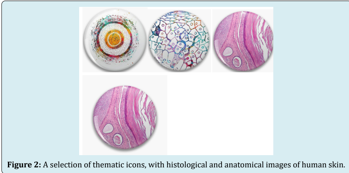
Figure 2: A selection of thematic icons, with histological and anatomical images of human skin.

This concludes the research, author's, thematic article devoted to the reflection in phaleristics, on badges, the anatomical and histological structure of human skin. The author is preparing materials for new research on the structure of various human organs and systems, as reflected in phaleristics, on badges.