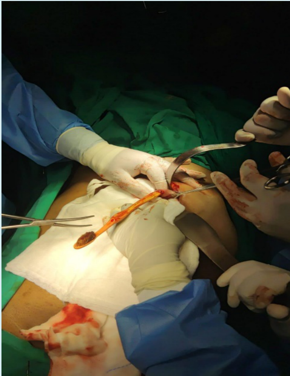
Figure 2: Showing removed Tooth Brush.