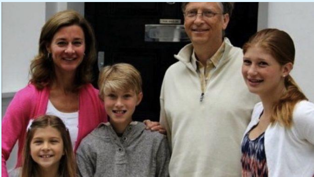
Figure 1: Bill Gates' non-vaccinated children.