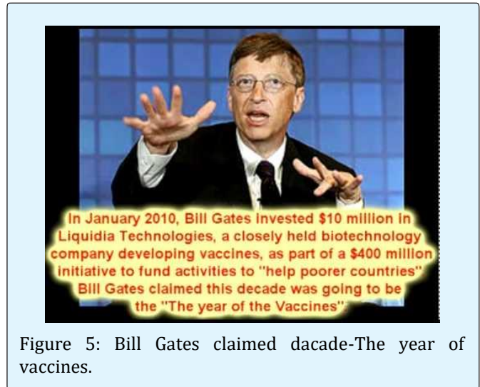
Figure 5: Bill Gates claimed decade-The year of vaccines.