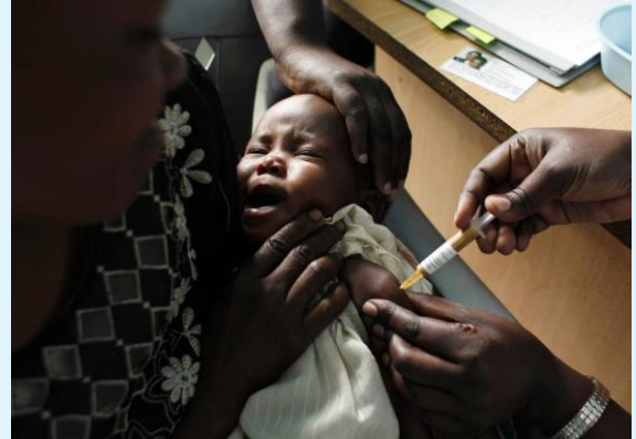
Figure 2: "Part of a trial at the Walter Reed Project Research Center in Kombewa in western Kenya, a mother holds her baby receiving a new malaria vaccine," [2].

America? In addition, mothers and children are being hunted down for vaccinations against their will in countries like Africa, Thailand, Brazil, and many others. Google Bill Gates Eugenecist [2].