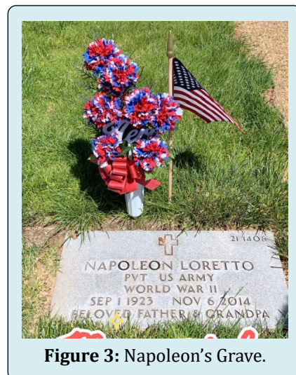
Figure 3: Napoleon's Grave.