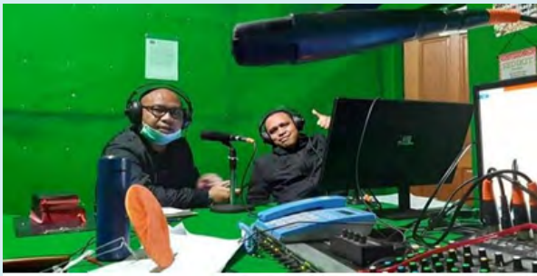
Figure 2: Talks how in Radio about Covid-19.

and Covid-19 command post. Some have handed over aid directly to the Command Post in the form of goods and money. This action activity continued with promotion activities to prevent the spread of Covid-19 continuously through the Ntala Gewang radio media of the Ruteng Diocese Church as shown in Figure 2.