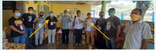
Figure 4: Task Force of Diocese Ruteng in one of the activities at Borong Parish.

In order to make the public more aware of the dangers of Covid-19, the Task Force Church Catholic Counseling conducted relief of Plastic Coat Personal Protective Equipment aid at Ben Mboi Ruteng General Hospital and spraying disinfectant in diocesan homes as shown in Figure 4. Subsequently, after coordination with the Parishes, disinfectants and spraying were carried out throughout the Ruteng Diocese Center area and several churches in Ruteng.