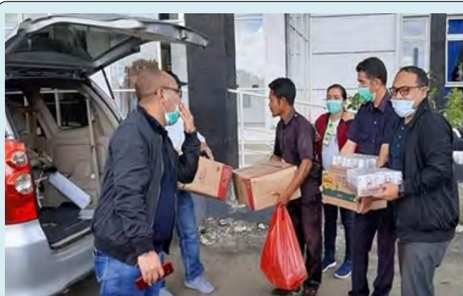
Figure 3: Distribution of basic food assistance to Communities.

The first relief activity was carried out on March 16, 2020 to the Ben Mboi General Hospital in the form of simple personal protective equipment and food supplements as shown in Figure 3. In collaboration with the secretariat of the Church Catholic Diocese Ruteng, the Instruction of the Bishop Ruteng related to the Covid-19 Outbreak, which was then distributed to the Parishes throughout the Church Catholic of Diocese Ruteng.