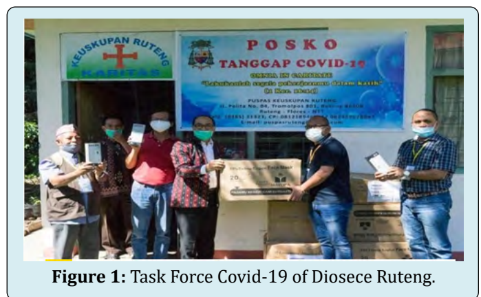
Figure 1: Task Force Covid-19 of Diocese Ruteng.

Internal and cross-sectoral coordination is first carried out with the Task Force through face-to-face meetings and ‘virtual’ contacts. This cross-sectoral coordination was followed by a joint meeting of the Manggarai Police Chief, ending with an information dissemination of the Decree of the Indonesian Police Chief in the Ruteng. After conducting cross-sectoral coordination as shown in Figure 1 the Covid-19 Church Response Unit of Ruteng Diocese coordinated internal The Ruteng Sufficiency Task Force, located in the capital cities of Manggarai, West Manggarai and East Manggarai regencies.