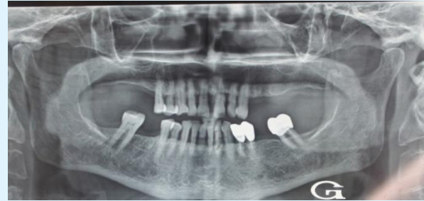
Figure 4: Panoramic radiograph.

35 and 37. A resorption of the right maxillary edentulous ridge was confirmed (Figure 4).