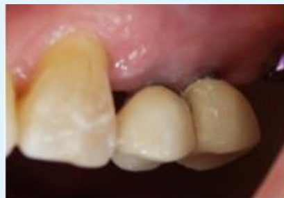
Figure 8: View of crowns sealed on the abutments.

Thereafter, we completed the implant-supported maxillary rehabilitation (Figure 9).