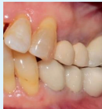
Figure 10: Left side view in maximum intercuspation.

In a later phase, the two temporary mandibular bridges were replaced by two metal-ceramic bridges (Figure 10).