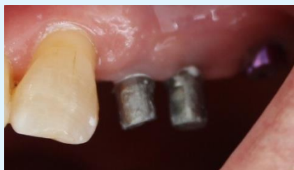
Figure 7: View of sealed abutments on mini dental implants.

For both mini dental implants, master impressions were performed after 10 weeks. In a first step, the metal abutments were sealed (Figure 7) and then the two metal-ceramic crowns. (Figure 8). Due care was given to excess removal of the cement to avoid any further complication.