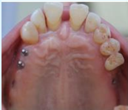
Figure 6: Occlusal view of the maxillary arch after implants placement.

The placement of two mini dental implants in maxillary premolar region and three implants in molar regions was performed by the Flapless technique in one session (Figure 6).