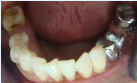
Figure 2: Mandibular Arch.

In the mandible, the teeth 46 and 36 were absent, metal retainers on teeth 34, 35 and 37 were evaluated and found to be defectuous (Figure 2).