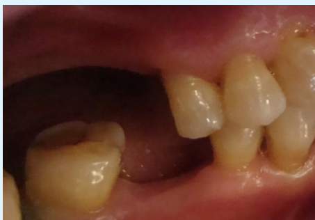
Figure 3: Right sideview in the maximum intercuspation.

Examination of the maxillary and mandibular incisors showed slight tooth mobility. Examination of the occlusion showed a prosthetic occlusal height reduced on the right side due to the tooth 47egression (Figure 3).