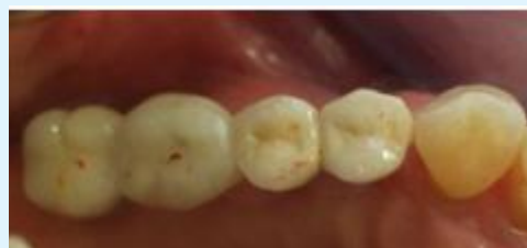
Figure 9: Occlusal view of the right maxillary rehabilitation.

Thereafter, we completed the implant-supported maxillary rehabilitation (Figure 9).