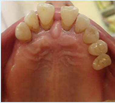
Figure 1: Maxillary arch.

In the mandible, the teeth 46 and 36 were absent, metal retainers on teeth 34, 35 and 37 were evaluated and found to be defectuous (Figure 2).