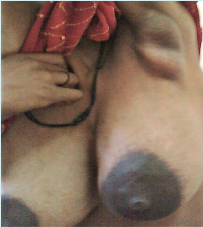
Figure 1: Photo of B/L mass axillae.

or cardiovascular abnormalities. Ultrasonography of the urogenital and cardiovascular system was normal. Both axillary breasts were excised under general anaesthesia, and histopathological report revealed a well-defined, capsulated intracanalicular fibroadenoma in both accessory breast tissues (Figure 2).