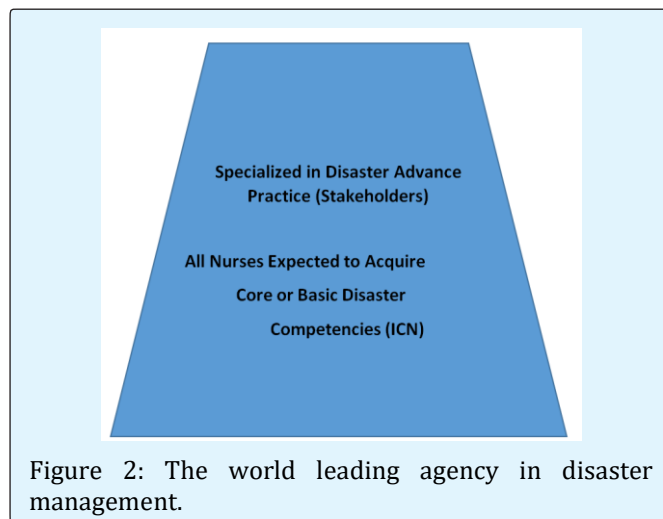
Figure 2: The world leading agency in disaster management.

Daily, (2010) [8] highlights un clarity of disaster terminologies required unifying disaster competencies concepts among the respondents with more focus on categorizing the disaster broad areas to more specific the competencies advancing specialized level. Universal United Nation Disaster Reduction as International strategies engaging stakeholders as specialized in disaster response matching each set of required competencies with assigned position i.e competencies may vary depend on nurses' role during disaster [10]. Demonstrating international council of nursing framework for disaster competencies would reveal complete picture of disaster nursing responses based on leveling the disaster competencies in relation to assigned positions [2] (Figure 2).