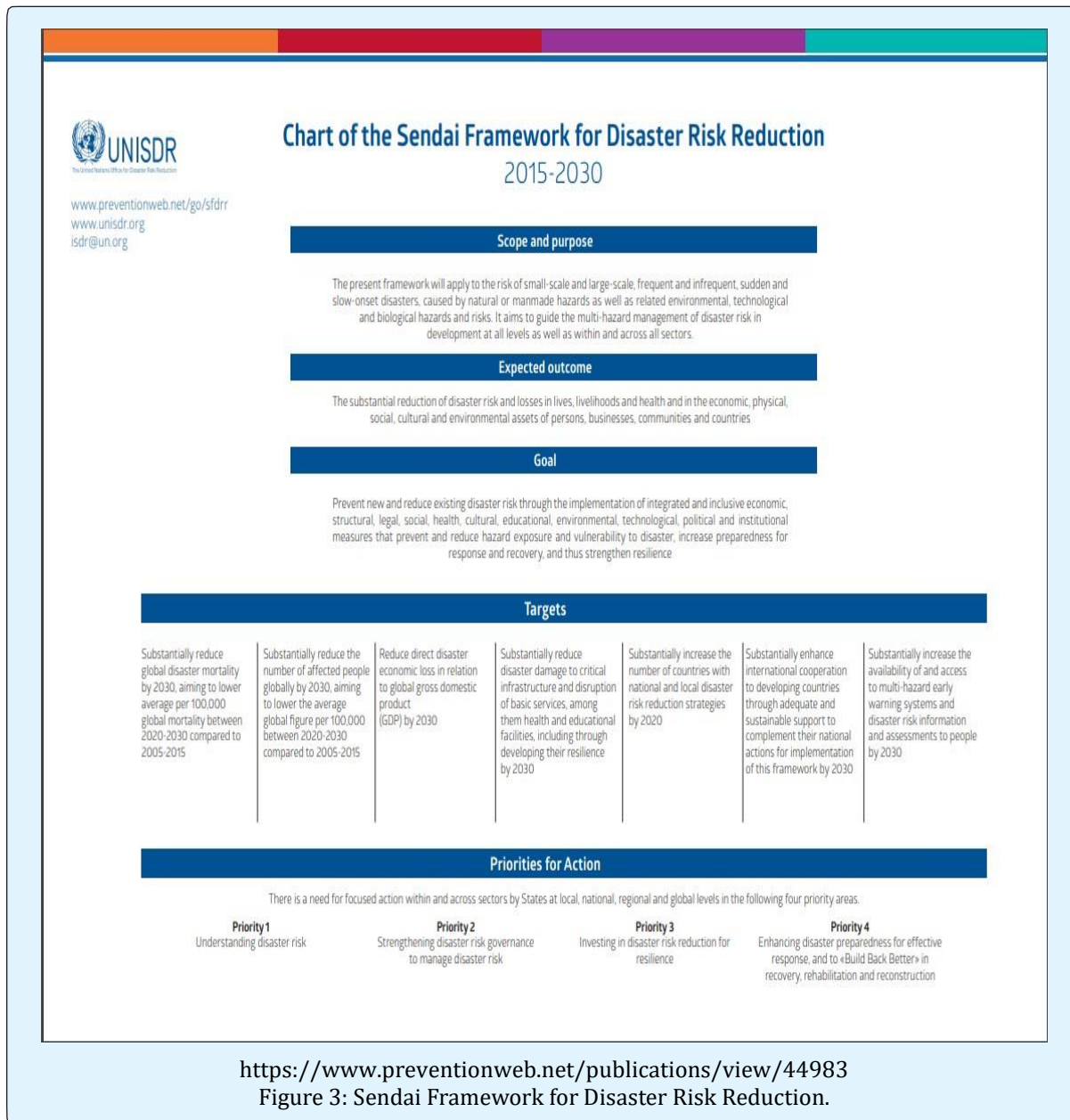
Figure 3: Sendai Framework for Disaster Risk Reduction.

disaster field. Resilience within health care system measure amount of change in their interventions while maintaining standards of care (Figure 3).