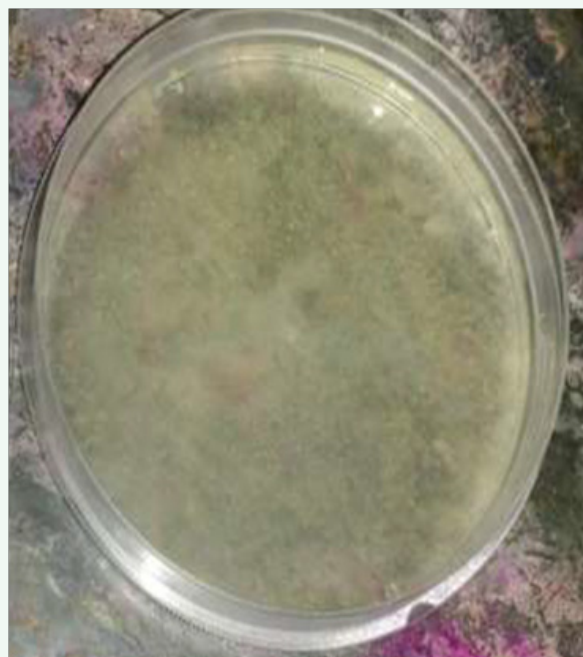
Figure 2: Chitosan-Gelatin transdermal patch