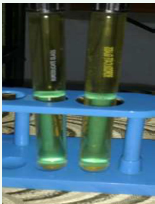
Figure 1: Colloidal Ag NPs

on an ice bath. The solution was cooled for 20 minutes. Further, a stir bar was placed in the flask and stirring was begun. 10ml of 1mM AgNO 3 was taken in a burette supported with a clamp and ring stand. This solution was added dropwise (1 drop/second) to the NaBH 4 solution. On addition of 2ml, the solution turned light yellow. When all of it is added, it turned darker yellow. The stirring was stopped as soon as all of the silver nitrate is added. The synthesized colloidal silver was characterized using UV-Vis spectroscopy and FT-IR spectroscopy. The transdermal patch was prepared using solvent casting technique [1, 5]. Chitosan (permeation enhancer) and gelatin (moisturizer) were mixed together in the ratio 1:10 (0.5g/1ml and 2.0g/10ml). To this 0.2ml of ethylene glycol (plasticizer) was added. Further, varying concentrations (0.4ml, 0.8ml, 1.2ml) of colloidal silver nanoparticles (drug) was added to it. The solution was filtered on a plastic tray under vacuum to remove air bubbles. Then it was dried at room temperature for 24 hours. Thin, flexible, transparent, and smooth patches were obtained. (Figure 1) (Figure 2) The antioxidant property of the patch was analyzed by Reducing Power Assay method as done by Jafri et al [6]. The reducing power of each sample was expressed as ascorbic acid equivalent.