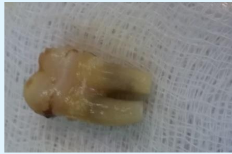
Figure 4: Root planning, conditioning & Apicectomy.