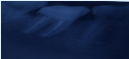
Figure 11: Follow-up (04 months) almost complete periapical healing.