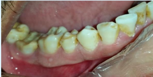
Figure 9: Follow-up visit: (1month).