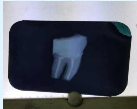
Figure 5: Postoperative radiograph.