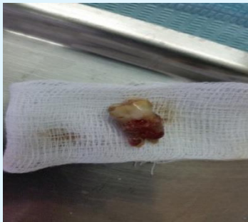
Figure 2: Atraumatic extraction of the tooth.