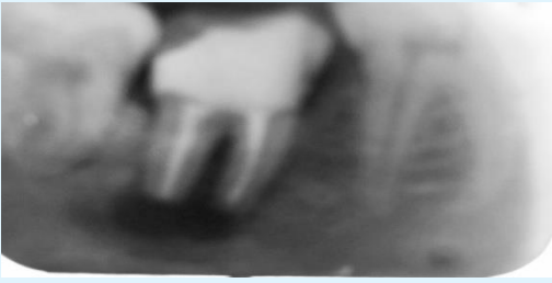
Figure 8: Radiograph after replantation.