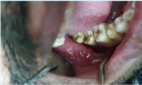
Figure 1: Preoperative photograph.

repaired by using Mineral trioxide aggregate (MTA). The 2-3 mm root-end was resected using diamond bur. Granulation tissue in the extraction socket was removed by gentle curettage and the socket was rinsed with sterile saline. The tooth was then gently replanted into the socket followed by gently pressing the buccal and lingual plates. The patient was asked to bite gently on a wooden stick afterwards which helped in stabilizing the tooth. The accurate repositioning was confirmed by radiography. The tooth did not require stabilization with splints as it was slightly cut-off from occlusion. Tab. Augumentin 625mg in combination with metronidazole 400mg was prescribed in BD dose for 5 days. Patient was recalled after 7 days for suture removal and every month thereafter for 3 months (Figures 1-11).