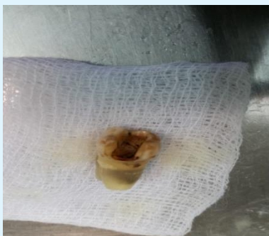
Figure 3: Access cavity preparation and root canal treatment.