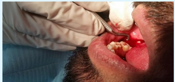
Figure 6: Debridement and curettage of the socket.