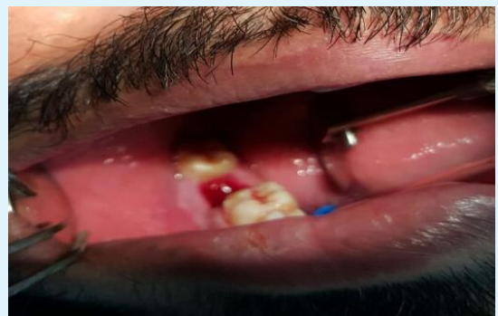
Figure 7: Removal of all the granulation tissue.