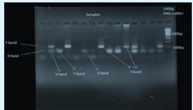
Figure 2: Electrophoresis in gel of amelogenin gene amplified.

accuracy of 74% [table 2]. When the difference between the groups was compared using chi square test, it was found to be statistically significant as p < 0.05 .