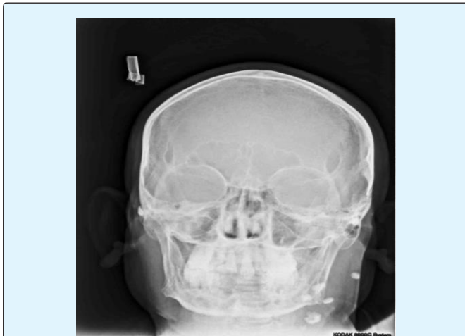
Figure 4: Posterior-anterior view showing round radiopaque mass on right side of mandible.