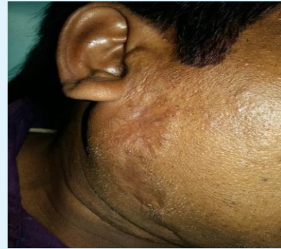
Figure 1: Scar seen on right side extending from preauricular region till submandibular region.

A 40-year-old male presented to department of oral medicine and radiology with chief complaint of dull aching type of pain in relation to lower right and left back tooth region since twenty days, which aggravated on having food and relived on medications (self medication-analgesics). Patient had a history of infection at 3 years of his age on right side of face adjacent to preauricular region and underwent topical medication for it. He described it as small solitary nodule which was measuring about 1x2cm and within six months of medication it subsided. Non-contributory family history. He gave a history of arecanut chewing. On extraoral examination Scar seen in relation to right side of face, ellipsoidal shape which was extending superoinferiorly—from preauricular region till lower border of mandible (approx submandibular region) measuring about 3 x 2 cm, mediolaterally-5 cm away from commissure of lip and 2cm ahead of angle of mandible. Presence of mild pigmentation, slightly raised borders and depressed center, no induration, showed no signs of inflammation or secondary changes. Palpatory findings revealed raised edges with depressed center, measuring about 3x2cm irregular in texture, and pea shaped nodules measuring about 1x 1cm in size, which were hard, non-compressible, non-fluctuant, non-tender with variable mobility (Figure 1).