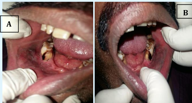
Figures 2A & B: Lichenoid reaction.

On intraoral hard tissue examination revealed presence of grade II mobility in relation to right and left lower posterior region pertaining to reported site. On local examination presence of discrete plaque like lesion bilaterally on labial vestibule & buccal mucosa surrounded by erythematous erosive area, with angular whitish area in centre approximately of 2x 2.5 cm, opposite premolar – molar region and mild melanin pigmentation at periphery. On palpation lesion was non scrappable (Figures 2 A and B ), based on clinical presentation Scar secondary to previously infected area in relation to right preauricular region, submandibular region and bilateral lichenoid reaction.