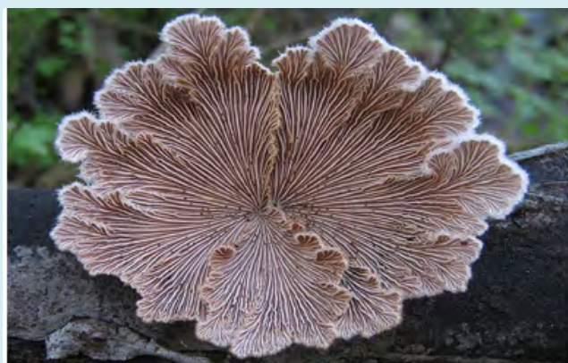
Figure 4: Schizophyllum commune (Locality: Marteleira, Lourinhã, Portugal. (Cited in https://commons.wikimedia.org/wiki/File:Schizophyllum_communne_Fr_299074.jpg ).