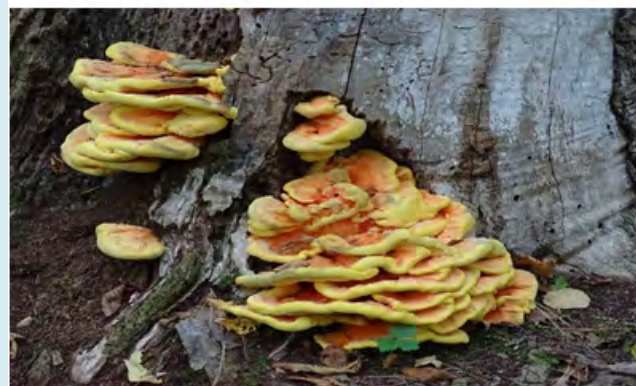
Figure 1: Laetiporus sulphureus (Locality: United States, Vermont, Eagle Mountain, Milton, USA).

hardwoods or conifers [21-23]. Laetiporus sulphureus can be easily recognized due to its striking yellowish or orange-coloured shelf-like fruit bodies. Also is easily recognizable in forests and urban areas due to its impressive size (up to 40 cm wide) and vibrant bright sulphur yellow to orange coloured porous basidiocarps (Figures 1 & 2). Laetiporus sulphureus is a source of bioactive compounds such as mono- and polysaccharides, laetiporic acids, beauvericin, lectins, triterpenes, pigments, benzofurans, \alpha -glucans, carotenoid pigments, and phenolic compounds [24,25]. Unlike other polypores, the Laetiporus sulphureus has a long history of consumption especially in North America, Japan and Thailand where it is considered a delicacy. Moreover, this fungus has long been used in Asian herbal medicine and is also known as a source of antitumor, antiviral, anti-inflammatory, anticoagulant, antioxidant, antibacterial, cytostatic, and immunostimulative agents and a producer of HIV-1 reverse transcriptase inhibitors [26].