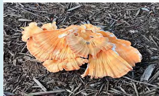
Figure 2: Laetiporus sulphureus (Photographs taken by Jillian Mattern, Locality: USA, Mississippi, Marshall, Wall Doxey State Park, hosted by http://mycoportal.org ).