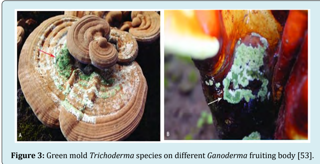
Figure 3: Green mold Trichoderma species on different Ganoderma fruiting body [53].

biofungicide is a good agricultural practice for management of plant diseases. The most benefits of bio-fungicide reside in their biocompatibility and biodegradability that it controls the disease without causing any damage to the plant and environment [59].