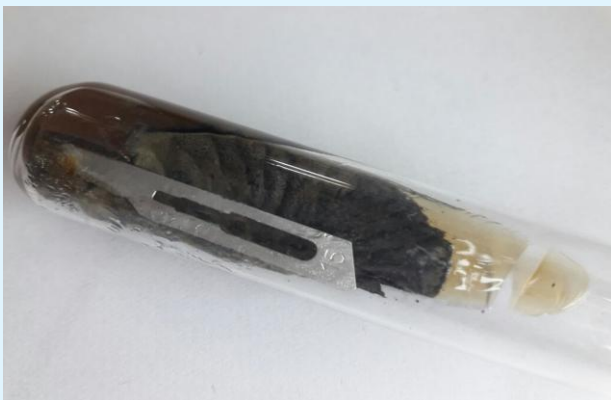
Figure 1: SDA slant showing growth of Fonsecaea spp.

Patient was treated with penetrating keratoplasty and topical amphotericin B (0.5%) every hour along with the oral ketoconazole. After 4 months the treatment was discontinued because clinical healing occurred. No relapse of infection was observed three months after the cessation of therapy.