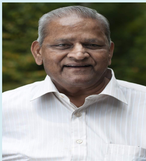
Figure1: Padma Bhushan Dr. Sengamedu Srinivasa Badrinath.