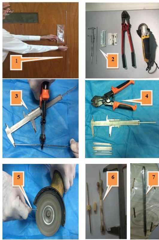
Figure 2: Steps of FGSR preparation, 1. Length of FGSR compare with the medical (IMP), 2. Tools requirement for FGSR preparation, 3. Measure and cutting the FGSR, 4. 10-11 pieces of FGSR, 5. Sharpening the end of the FGSR, 6. FGSR used for fixation of natural and synthetic bony implantation, 7. Sterilization of the prepared FGSR.