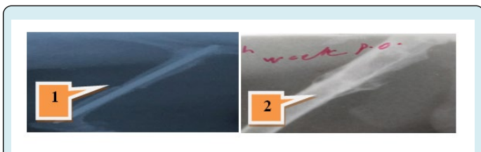
Figure 3: The advantages of using FGSR, Radiographic finding of internal fixation of the FGSR. 1. Proper fixation of the complete induced transverse femoral mid shift fracture first week p. o. 2. Remove the FGSR after fracture healing.