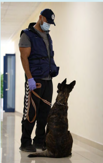
Figure 1: Simple barrier protective equipment is worn during every training session.

Validation protocol: The validation sessions took place in Dubai police k9 training centre. No samples used for training were used for validation. Most of the time, five-cone olfactory line-ups were used. Seven-cone line-ups were used at the end of validation when dog handlers considered their dog ready for deployment in the field. There was always only one covid-19 positive sample in the line-up, with the remaining cones containing covid-19 negative sample(s) (at least one in the line-up) or being empty (i.e. without sampling material). The covid-19 positive and negative sample locations in the line-up were randomly assigned and samples were placed by one dedicated person who remained in the room. The data recorder collected data in the room using dedicated software developed by Dubai police (Figure 2) and was blinded to the covid-19 positive and negative sample locations. Once the samples were placed behind the cones, the handler and the dog entered the room and the dog was asked to sniff each cone, one by one. There was no visual contact between the