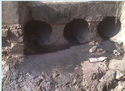
Figure 1: Effluent Discharge Point, FATA Tanning Company.

\mu\text{m} ) of polysiloxane immobilized thiosalicylic ligand system in an Orbital shaker (SI-300R) at 100 oscillations for 2 h at 303 K. The resultant solutions were filtered using Whatman No.41 and the residual metal ( \text{Cr}^{3+} , \text{Fe}^{3+} , \text{Cu}^{2+} , \text{Pb}^{2+} and \text{Zn}^{2+} ) concentrations analysed using Agilent MPAES-4200. This protocol was repeated separately for polysiloxane immobilized thiolactic, mercaptoethanol, thiosalicylic-thiolactic, thiosalicylic-mercaptoethanol, thiolactic-mercaptoethanol ligands respectively (Figure 1-4).