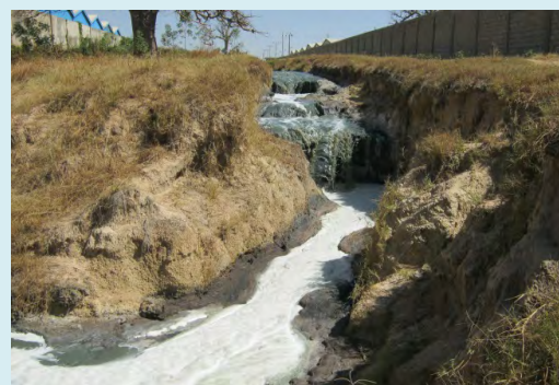
Figure 4: Effluent Discharge Collection Point.